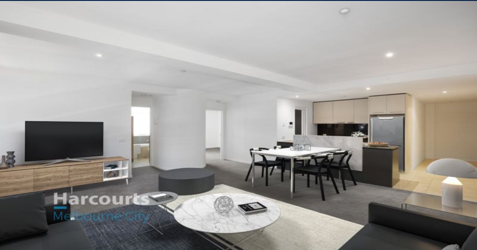
1206-118 Russell St Melbourne