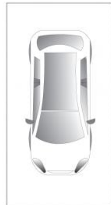
(NOT IN POSITION)