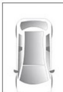
OVER BONNET STORAGE (SPACEMATE) (NOT IN POSITION)