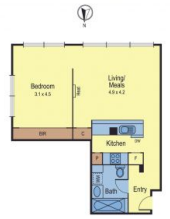
Internal Floor Area: 56 sqm approx.