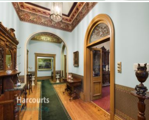
490 St Kilda Road MELBOURNE, VIC